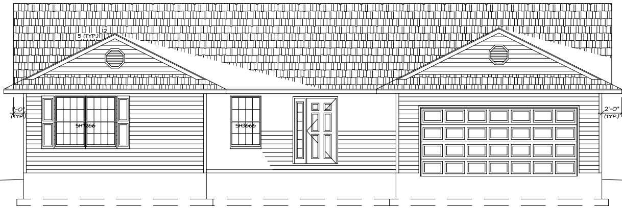
1 FRONT ELEVATION A-1 SCALE: 1/4"=1'-0"